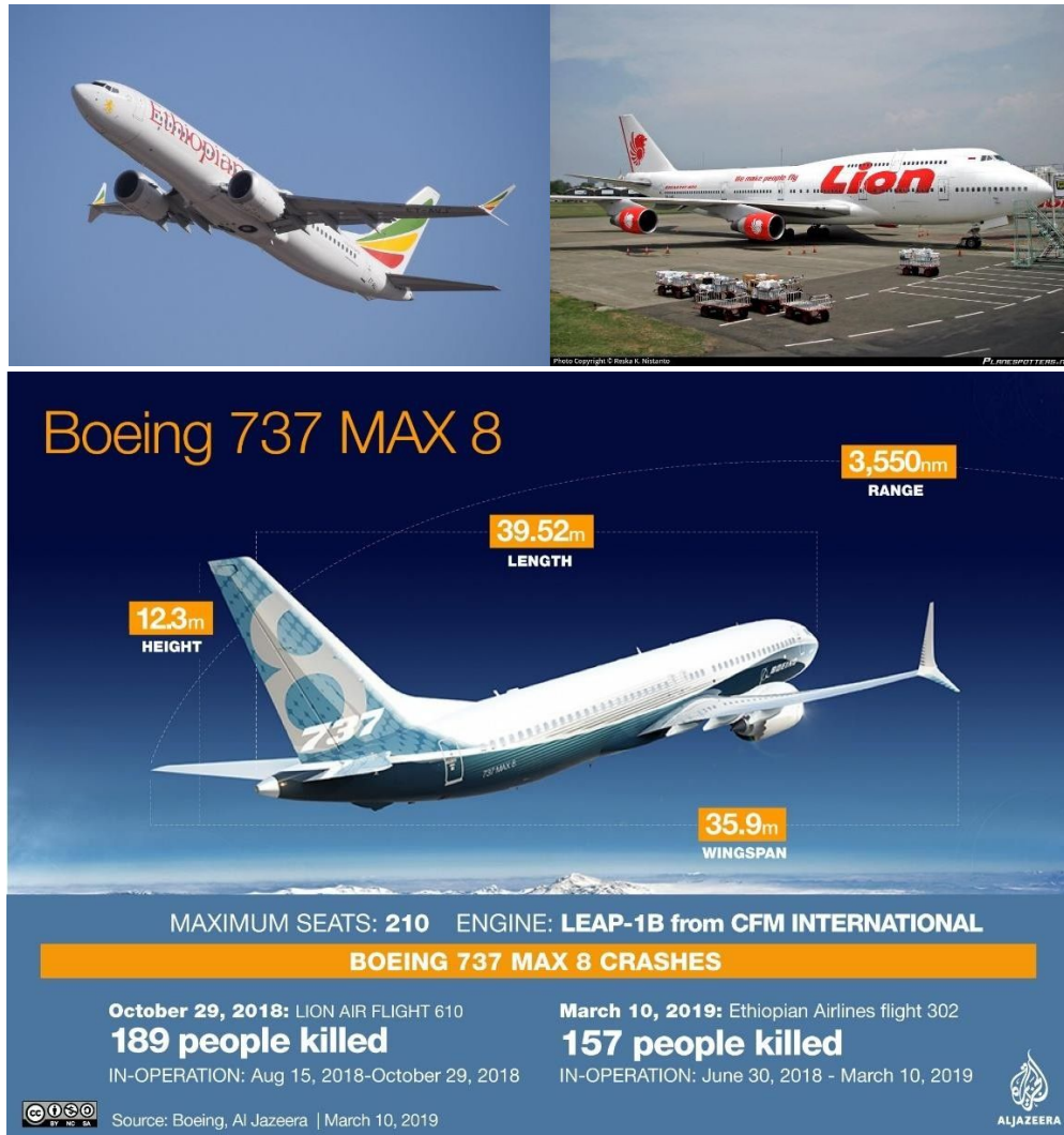
Fig 2: Statistical details of Boeing 737 Max 8 airline

possibility of error from the airlines company is considered to be the reason of the potential crash, they were not expected to report malfunctioning of the sensors from the first instance itself. Investigations later reported that no physical damage had occurred to any of the two sensors. However, they sent some erroneous inputs to the MCAS system [2] which confused the main flight computer to misinterpret the angle of attack.